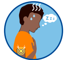
Feeling unwell, muscle aches, feeling tired