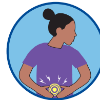
Nausea, vomiting, diarrhea