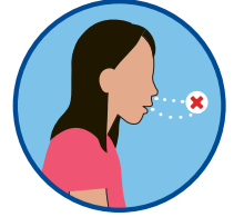
Loss of taste or smell

If "YES": Stay home, self-isolate & get tested or contact your child's health care provider.