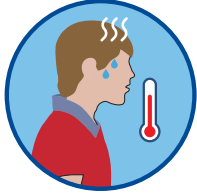
Fever > 37.8°C