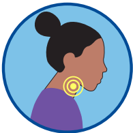
Sore throat, painful swallowing